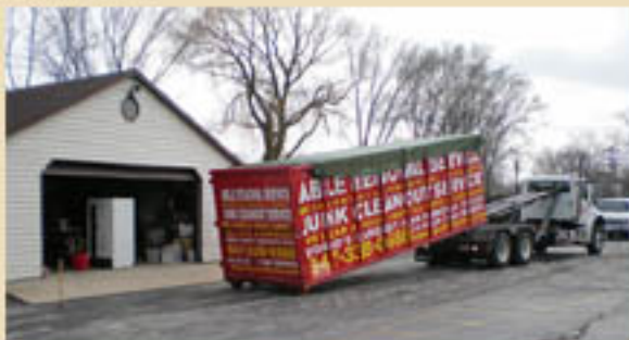
Cleaning out garage to make room for the food pantry!